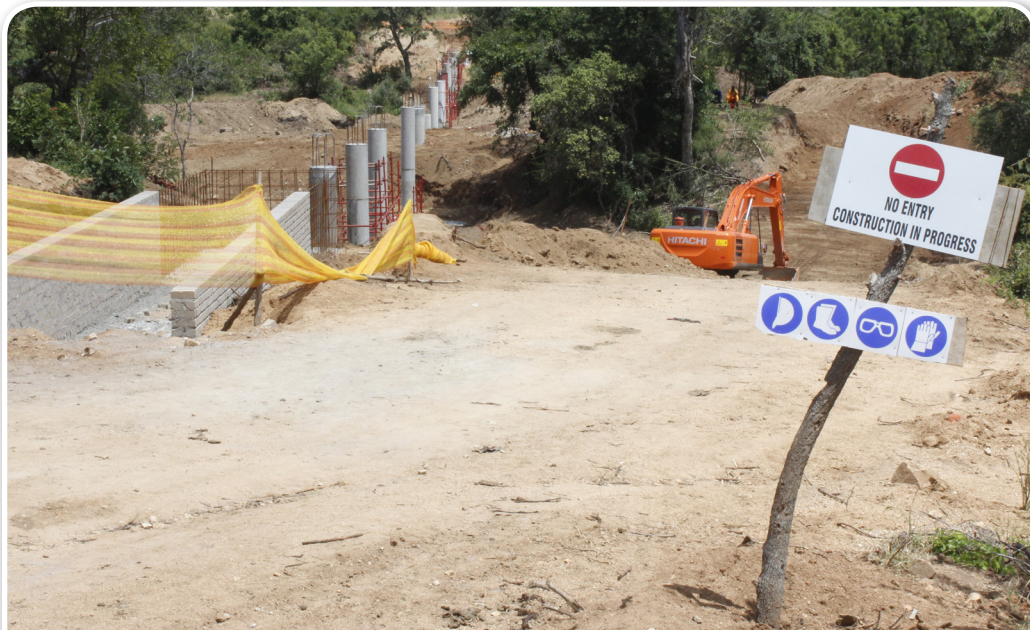
WORK IN PROGRESS: The construction of the Ronaldsey Footbridge underway.

Progress on the construction of the Ronaldsey footbridge outside Mkhuhlu within the Bohlabela District is on track and will soon bring relief to the local communities. The construction of the 180 meter bridge with a walking part of two meter started in October 2014 and is expected to be completed in 2015 at a cost of R7.1 million.