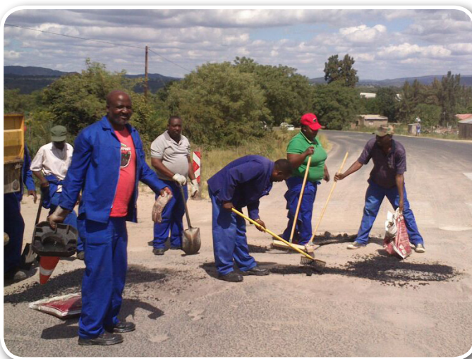
BENDING WITH PRIDE: Team Chochocho Cost Centre patching of potholes.