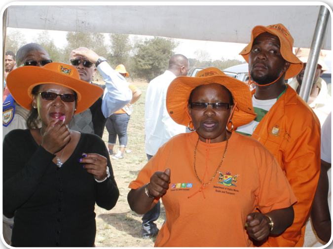
ORANGE AT HEART: Departmental employees ready to inspire the youth.