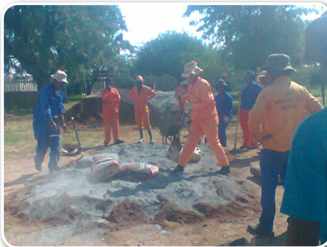
ON DUTY: Workers at Dr JS Moroka hard at work.