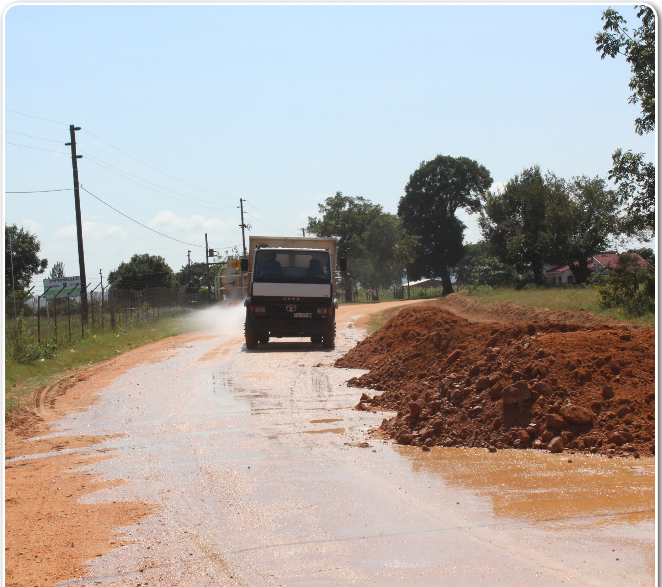
ROAD REGRAVELLING: D2971 under major regravelling.