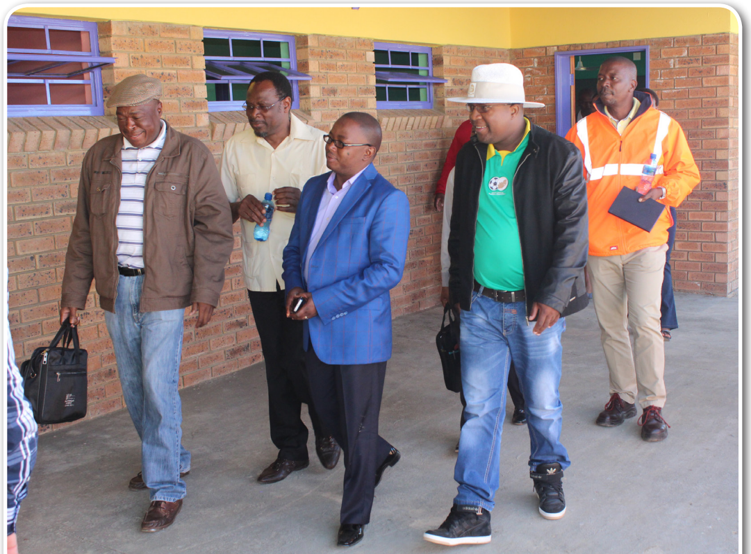
ENSURING ORDER: Members of the Portfolio Committee visiting the construction site of Osizweni Special School.

I n order to ensure that all infrastructure projects that are implemented by the department are checked, monitored and that they are at a good state, a delegation comprising members of the Provincial Legislature Portfolio Committee responsible for Public Works, Roads and Transport together with the Management of the Department visited a number of projects to have first