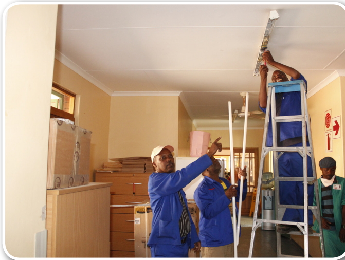
HANDYMEN: Electricians fixing lights in government premises.