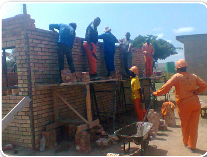
MUD AND BRICK: Departmental team hard at work constructing offices.