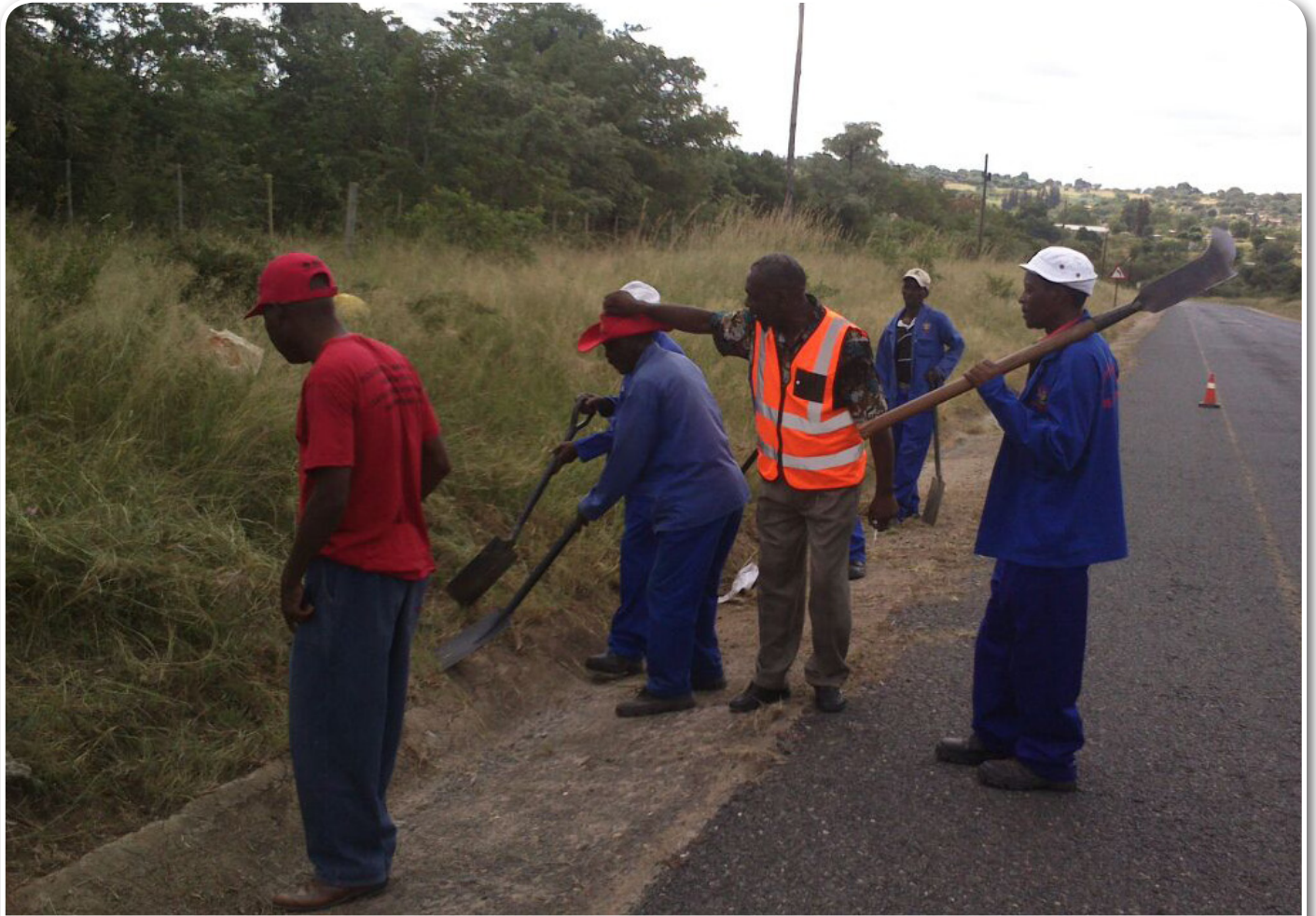
PICK AND SPADE: Chochocho Cost Centre site drainage team cleaning roadside drainage on the road between Thulamahashe and Dwaarsloop.

When site drains are not cleared and pipes not cleaned on regular basis, water is flooding the street and can cause danger to the motorist and it will cost the Department lot of money to fix damaged roads.