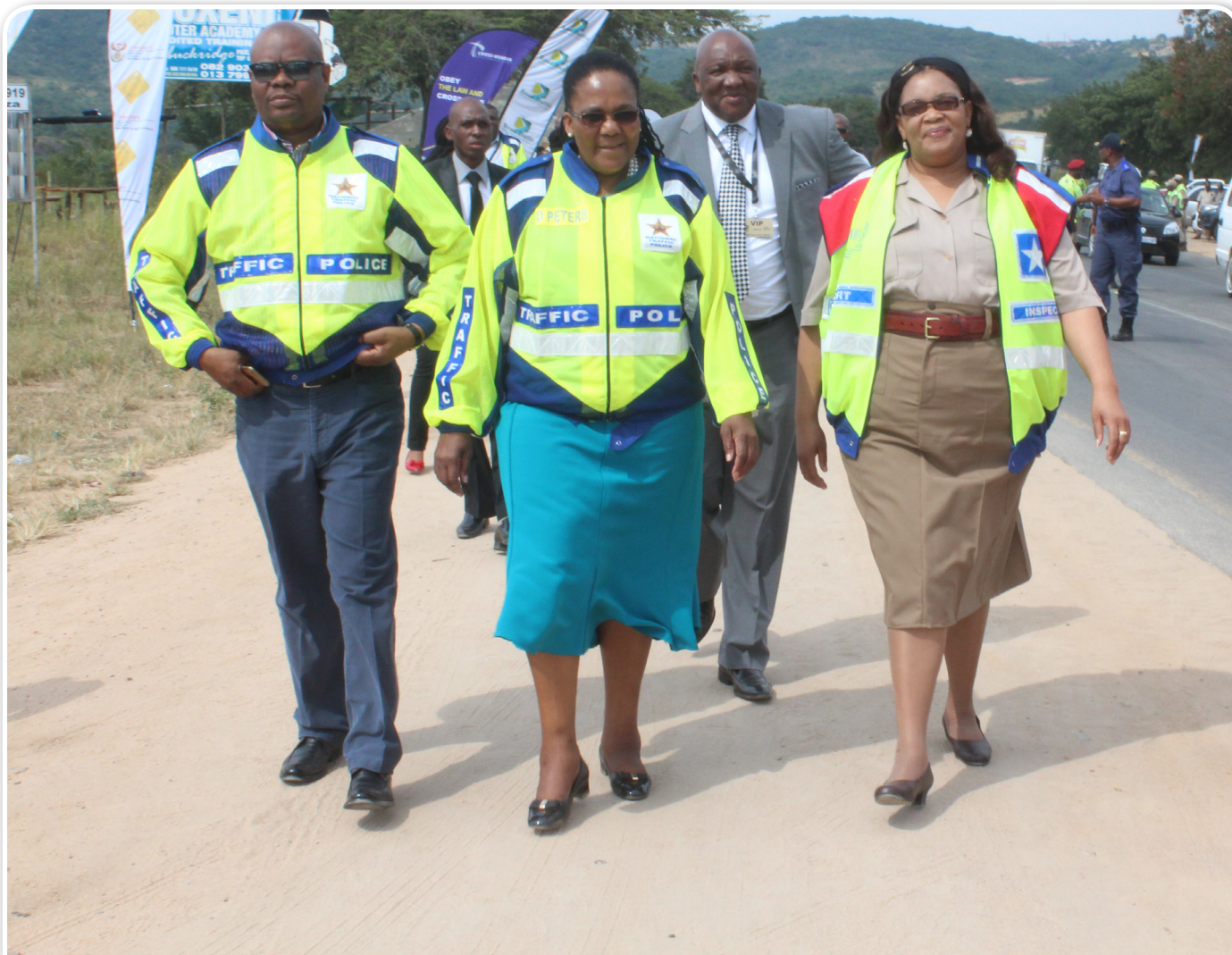
HARD AT WORK: Minister Dipuo Peters and MEC Dumisile Nhlengethwa during the national launch of Easter Arrive Alive

D waarslop came to a standstill when Transport Minister, Ms Dipuo Peters accompanied by both MEC'S of Department of Public Works, Roads and Transport Ms Dumisile Nhlengethwa and MEC for Department of Community Safety and Security Liaison, Mr. Vusi Shongwe and Bushbuckridge Mayor, Mr Renias Khumalo, launched the National Easter Arrive Alive Campaign in Bushbuckridge Municipality on 27 March 2015.