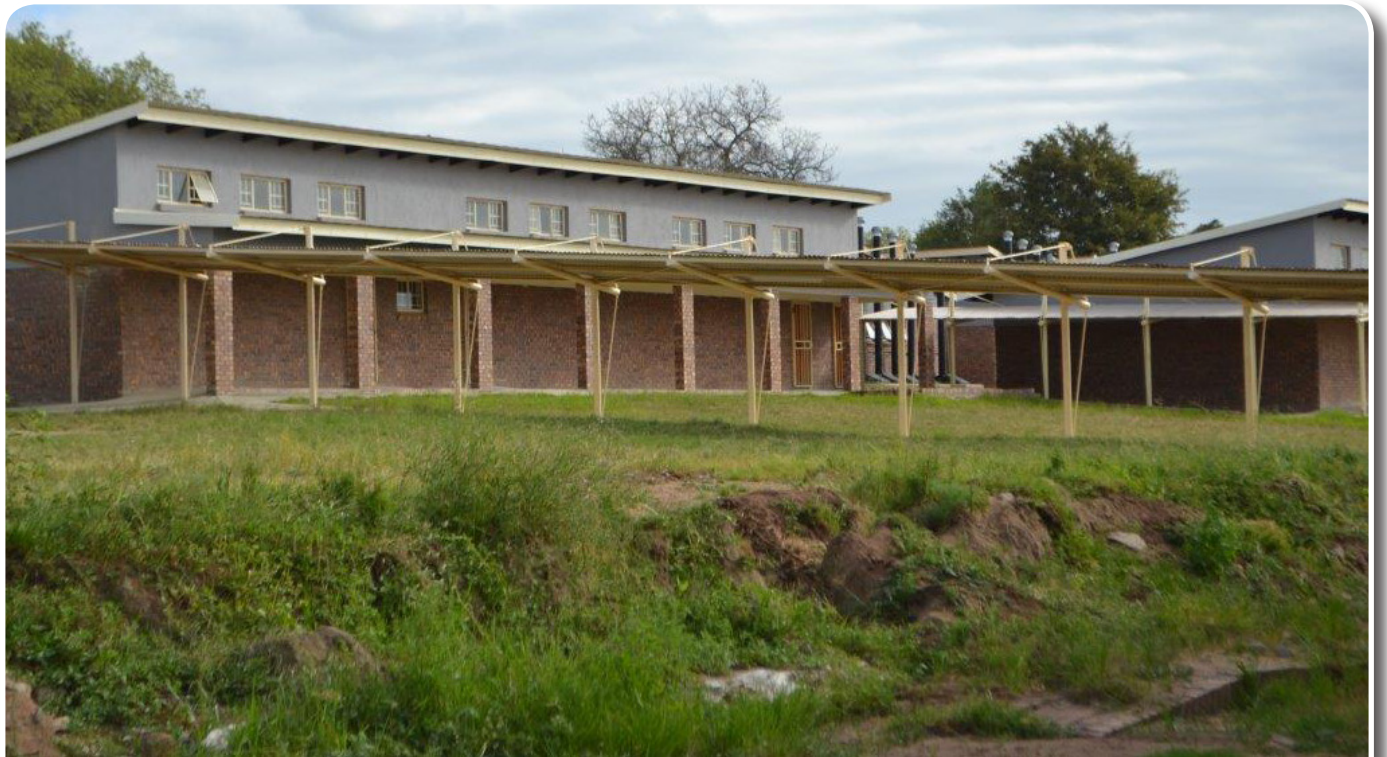
NEW HOPE FOR LEARNERS: Newly constructed Samuel Mhlanga Primary School at Allendale, Bushbuckridge Local Municipality.

The construction project was under the Expanded Public Works Programme (EPWP) guidelines. More than 40 work opportunities were created under this project. An amount of more than R1million was spent on local labour and R2, 5 millions on local subcontractors. Skills like drainage work, reinforcing steel fixing, concrete work and brick laying was also developed during construction of this project.