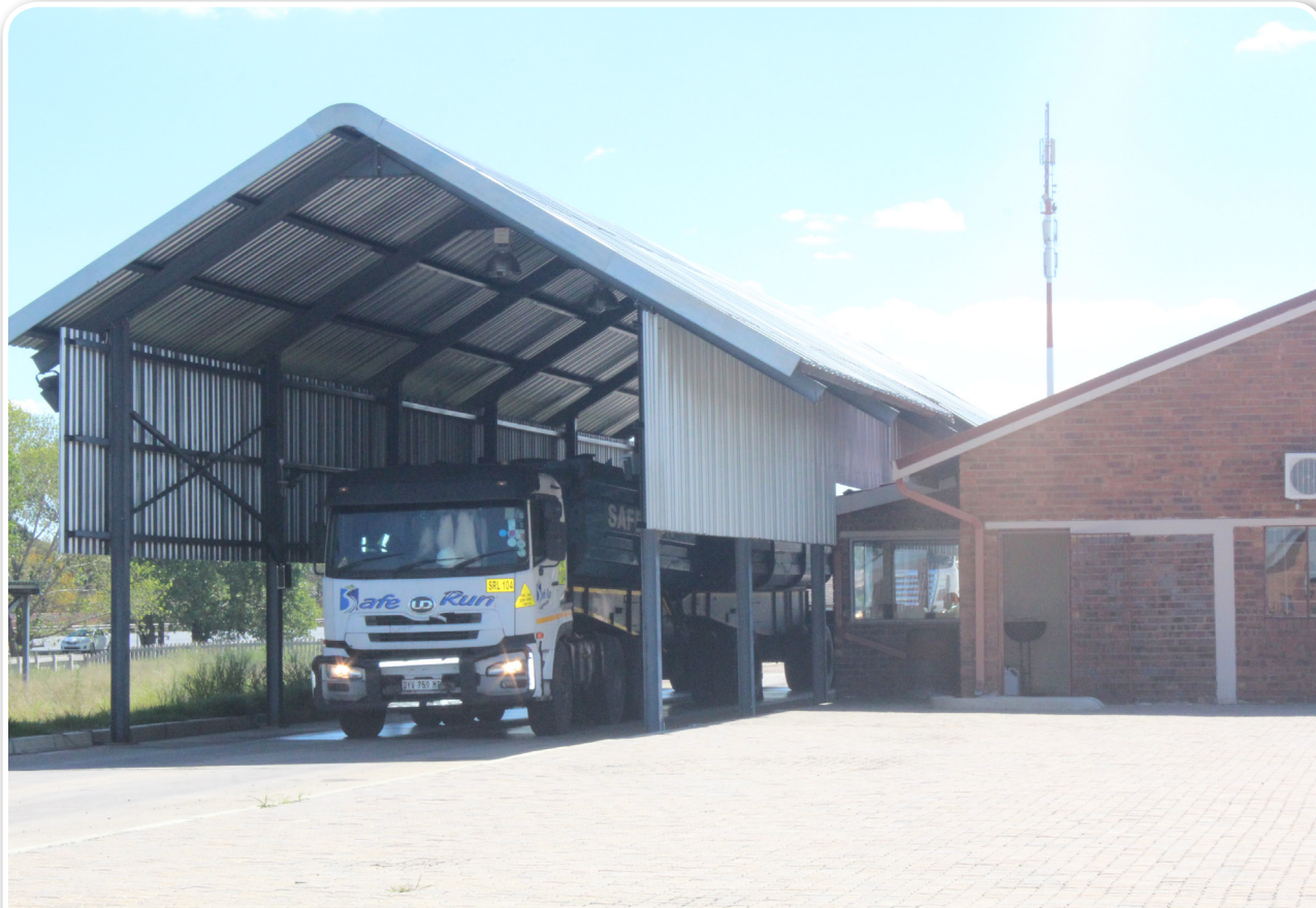
ENSURING COMPLIANCE: A truck being weighed its mass at the Bethal Weigh Bridge.

The project involved the upgrading of the administrative offices, and the construction of a control room building, guard houses, concrete paved parking area for 24 heavy type interlink vehicles, and the upgrading of the adjacent N17 road to provide for the weigh-in-motion scales in separate dedicated lanes, and to provide for access to and from the N17, which falls under the jurisdiction of SANRAL.