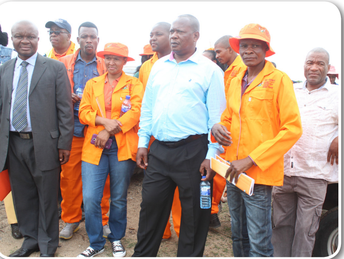
SUITS AND OVERALLS: Officials from Ehlanzeni district rolling out service delivery.