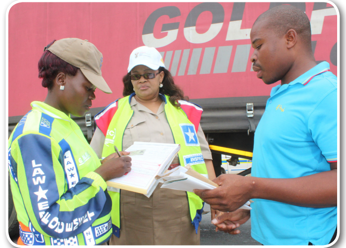
NO LAUGHING MATTER: Driver receiving traffic fine for non-compliance.