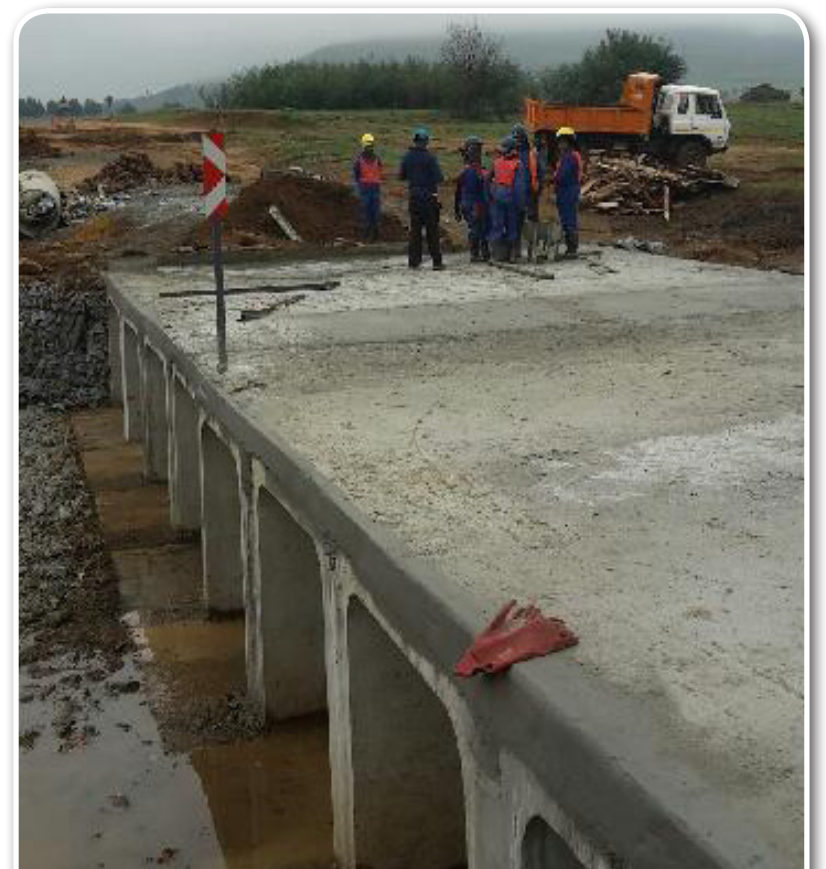
MANAGING DISASTER: Leiden Bridge under construction.