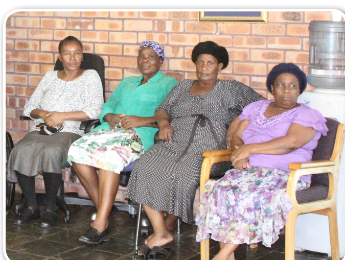
TIME TO REST: Ladies who keep government offices sparkling.