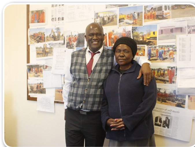
WHEELS OF SERVICE DELIVERY: Officials from Dr JS Moroka Cost Centre.