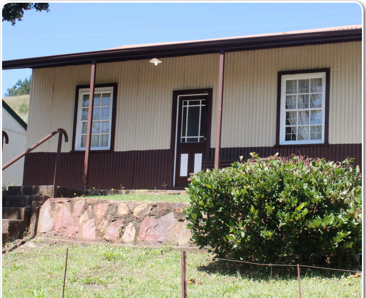
ENJOY YOUR STAY: One of the 6 Guest Houses renovated in Pilgrims Rest.

Meanwhile, work is underway to enhance the beauty of Pilgrims Rest with extensive landscaping already complete and renovation of braai areas on cards. Workers are busy cutting the grass with daily maintenance taking place in town. When asked about the contingency measures at Pilgrims Rest in case of veld fires, Mr Dibakoane confidently assured visitors that the Department has a team of fire fighters which have previously received training at the Hoedspruit South African Defence Force and can handle veld fires if the disaster strike. "They have been trained to deal with basic fire fighting skills," he added.