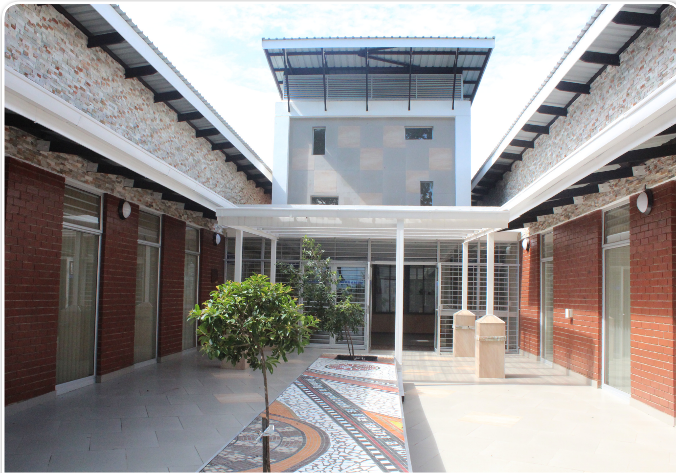
THE HUB OF KNOWLEDGE: Newly constructed Umjindi Community Library.

The Umjindi community has joined a long list of jubilant communities that enjoy the privilege of receiving a new library. In an effort to improve service delivery, the Department recently completed a state-of-the-art public library in Barberton. The construction of the library as the hub of information has unleashed new opportunities and improved the quality of learning and research among others for the thriving community.