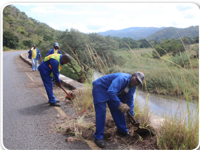
PICK AND SPADE: Barberton Cost Centre staff clearing roadside.