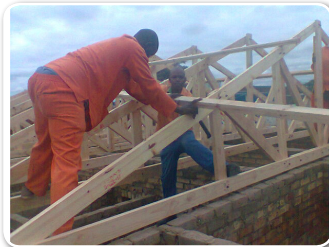
RIGHT TOOLS AT HAND: Departmental workforce showcasing their skills in carpentry.