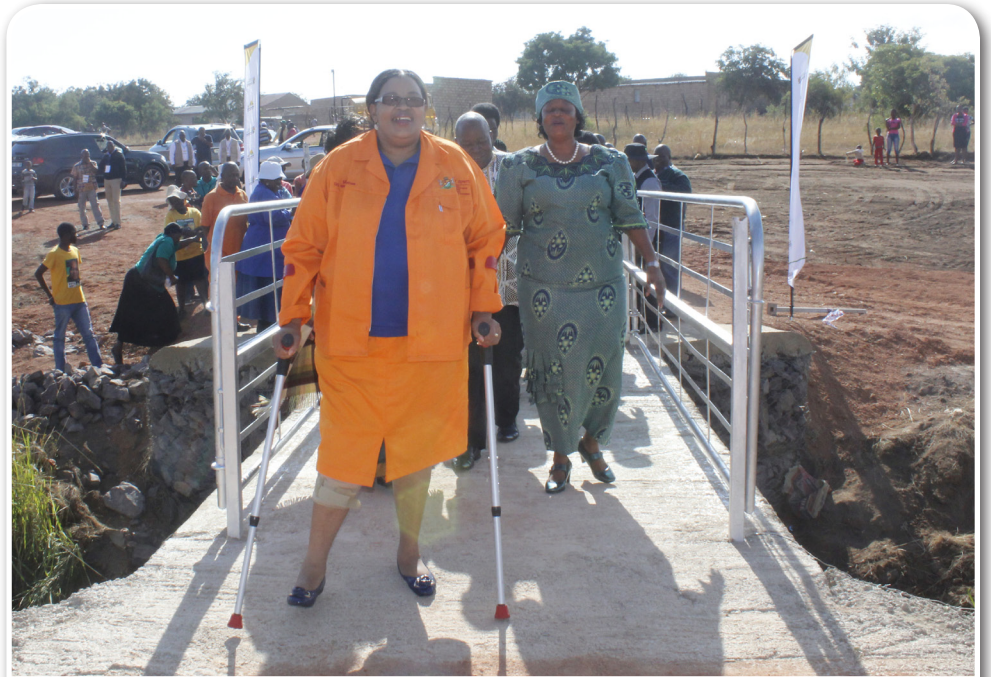
NO MORE FLOODING: MEC Nhlengethwa and MEC Mhaule during the official handover of the footbridge at Ezakheni.

The Department did it again. A footbridge was built for the community of Ezakheni at Thembisile Hani Local Municipality. The project was completed on the 24th of April 2015. The department has spent up to R252 830.00 to build the bridge.