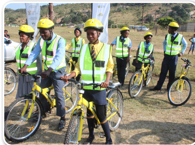
READY TO RIDE: Some of the learners who benefited from the Shova Kalula programme.