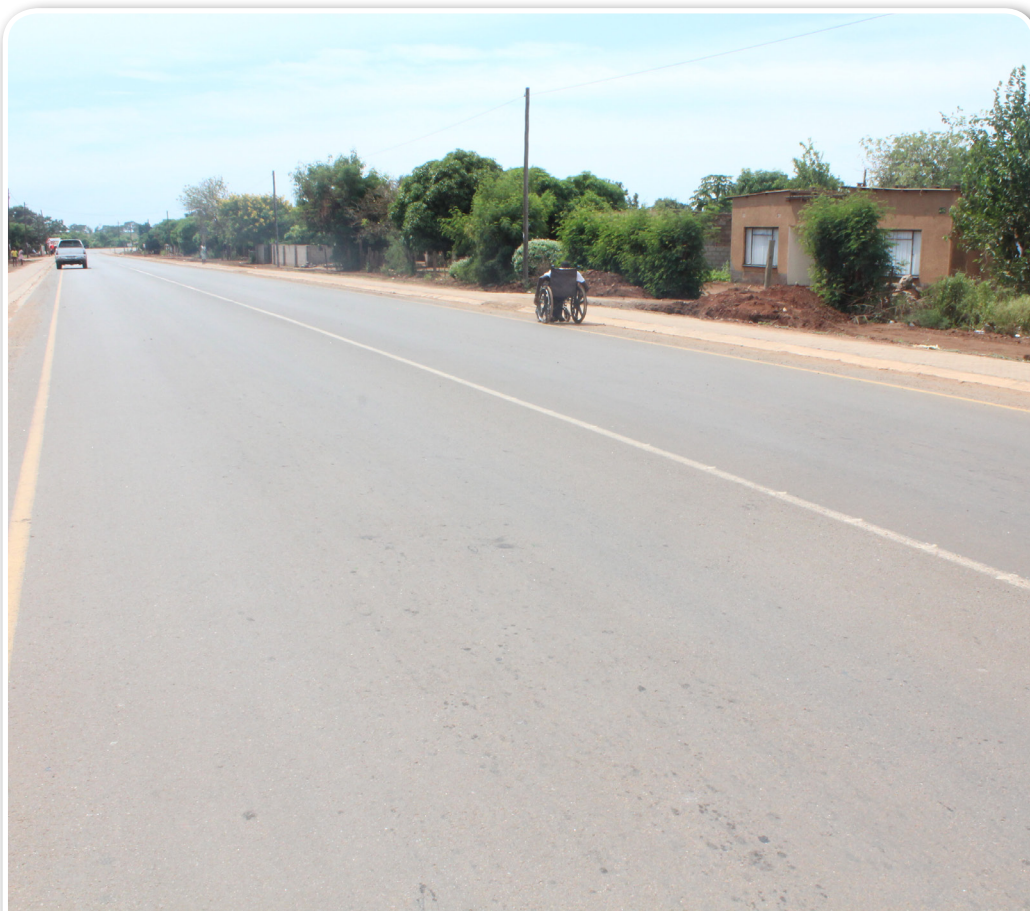
SMOOTH RIDE: People with disabilities are now enjoying the smooth and tarred D797 between Tonga and Ngwenyeni.

The rehabilitation of the road has been plagued by major delays which were due to heavy floods hampering the construction of the road as well as other unrest within the area. The abnormal rainfall caused damage to some parts of the new road. This prompted the department to put the project on halt with the aim of sourcing funds to fix the damages of the new road, before proceeding with the rehabilitation of the entire road project. The delays instigated community protest, which further made it difficult for the contractor to proceed with the work.