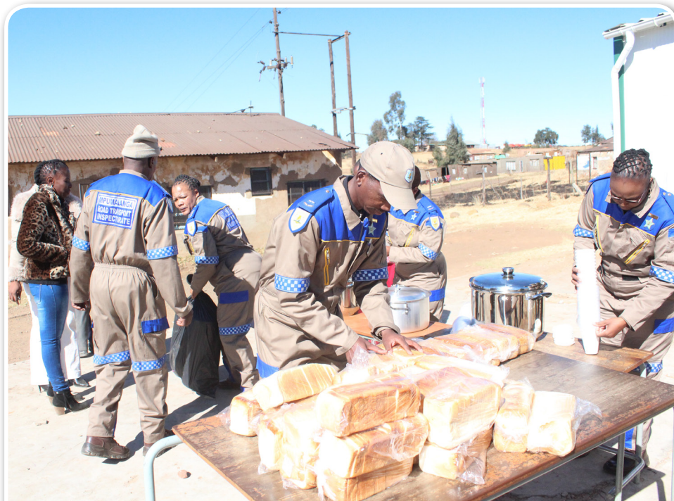
BLESSED HANDS: Transport Inspectors preparing food for New Ermelo Primary School learners.

They are not only Transport Inspectors but angels sent from above to lend a hand to the needy. It was proven when Transport Inspectors in Gert Sibande District donated food and school uniform to disadvantage learners at New Ermelo Primary School.