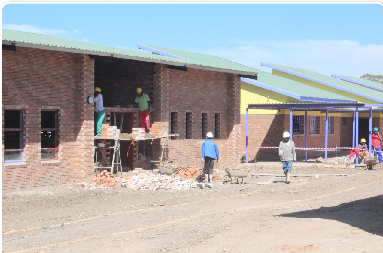
CONSTRUCTION IN PROGRESS: Workers busy constructing Osizweni Primary School.

The purpose of the oversight visit by the Portfolio Committee is to check the status of projects implemented by the Department of Public Works, Roads and Transport and make recommendations upon which the Department is expected to make interventions in order to ensure that projects are implemented as per the specifications.