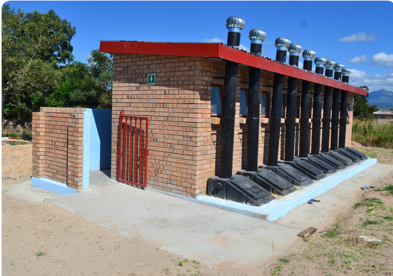
ENVIROLOO: Newly constructed toilets at Shanke Primary School.