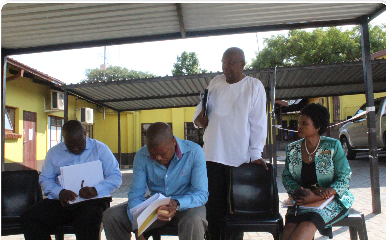
BUSINESS UNUSUAL: Presidency visits KaNyamazane Community Health Centre.

The presentation received a warm welcome from the Office of the Presidency as they were happy about the progress done in the KaNyamazane CHC. They were very excited especially about the issue of the disability ramp and disability toilets for both male and female. The meeting ended with a site visit in all the projects which were committed by Department including the KaNyamazane CHC.