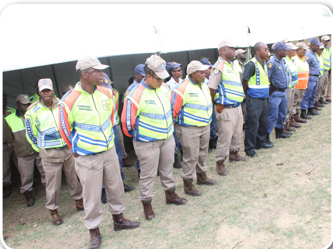
ATTENTION: Law Enforcers ready to take off during Easter Arrive Alive campaign.