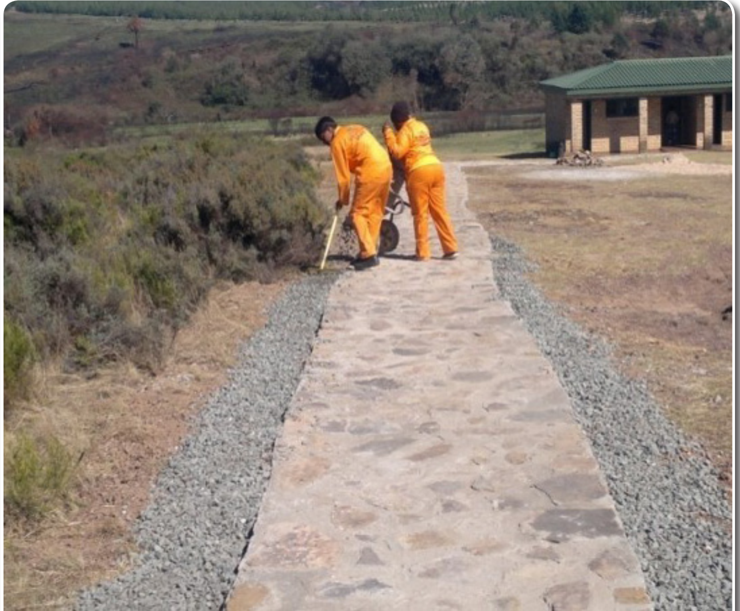
GETTING HANDS DIRTY: National Youth Service participants hard at work at Manyeleti Nature Reserve.