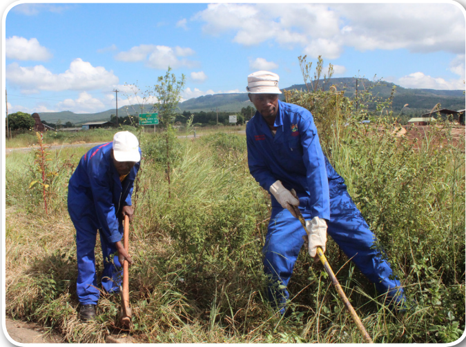
NOT PLOUGHING: Road Workers removing grass by the road side.