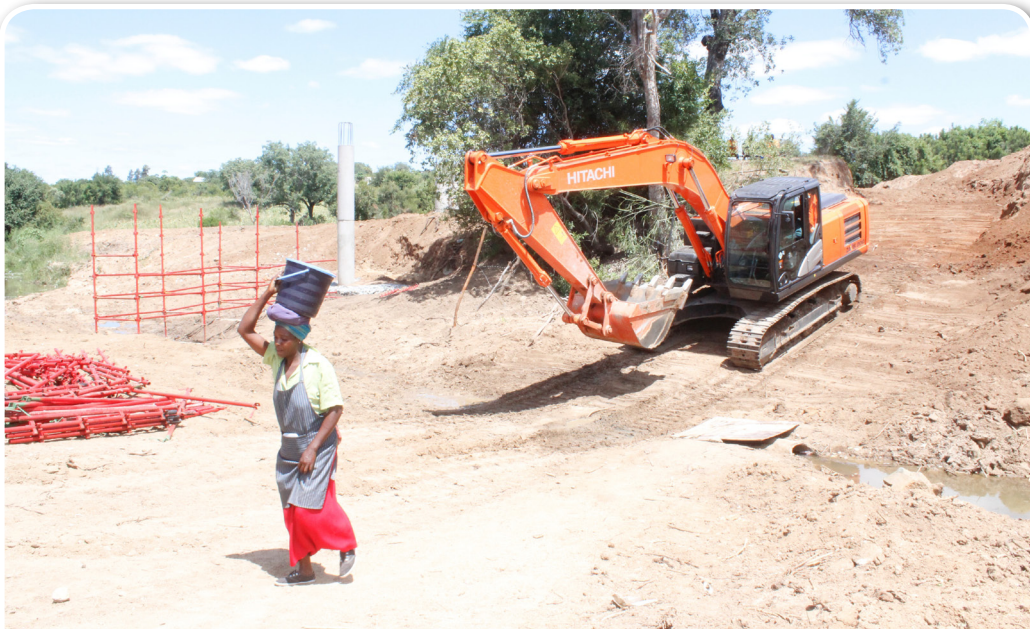
PREPARING FOR A BETTER LIFE: Residents of Ronaldsey will soon be able to pass to the other side of the community after the completion of the foot bridge.

It was so amazing that the Inspectors pop out the money out of their pockets to buy the school uniform and the food for lunch. About 100 learners received the uniforms which was a great achievement.