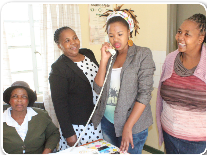
HAPPY SERVANTS: Team Elukwatini Cost Centre.