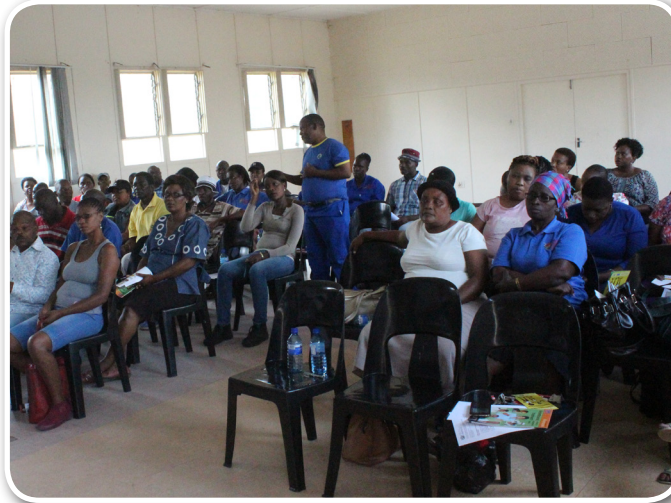
ALL EARS: Departmental staff attentively listening to the words of wisdom.