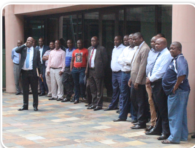
GLOBAL PROBLEM: HOD Mohlasedi addressing the staff regarding economic challenges.