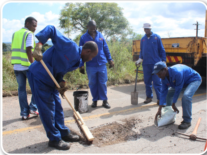
REAL MEN AT WORK: Road workers patching potholes.