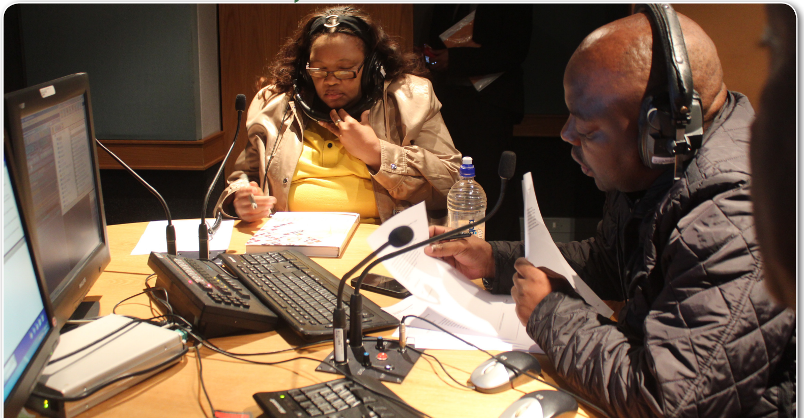
STOP THE CONFLICT: MEC Nhlengethwa at the SABC studio talking about the Taxi Conflict.

meantime, if you do not co-operate and work together. Government takes strong exceptions to unlawful acts and will not hesitate to take actions to protect the rights of all citizens to move freely without intimidation. The Provincial Government express utmost regret and unconditionally apologize to all road users and commuters for the inconvenience caused by the disruptions," she said.