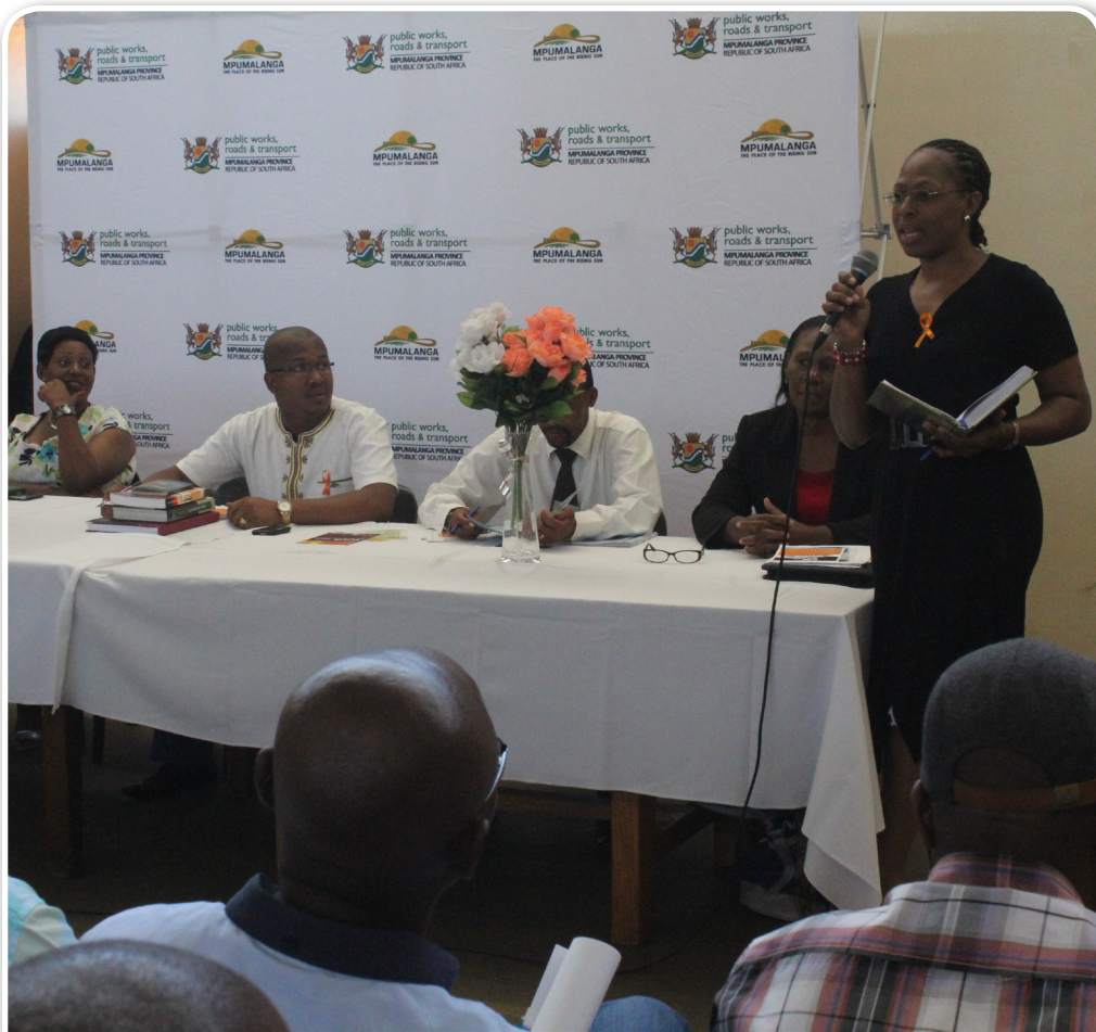
SAY NO TO DRUGS: Ehlanzeni staff tackling alcohol issues.

The Employee Health and Wellness (EHW) Directorate beat the drum and sounded a call to all employees to fight against alcohol and substance abuse in the workplace during a workshop which was held in Barberton on the 10th of March 2015. Experts on the subject from various faculties and entities rendered a handful of presentations focusing on the catastrophic impact of alcohol and substance abuse which not only destroys affected individuals but equally undermines service delivery.