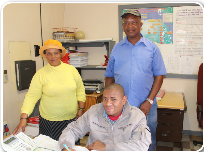
ROLL CAMERA: Officials from Mayflower Cost Centre.